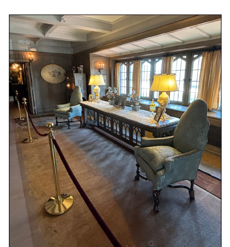
Parlor in Arms Family Museum

The "Mid Century Modern" exhibit explores the design period from the late 1940s through the 1960s when designers embraced technological advancements using bold colors and streamlined edges. Featured are highlights from the 1948 Youngstown Kitchens Set made of steel and pieces from the Plakie Toy Company. While not as large or elegant as our Stan Hywet, the Arms Museum on Youngstown's former "Millionaires Row" (Wick Avenue) is worth a visit.