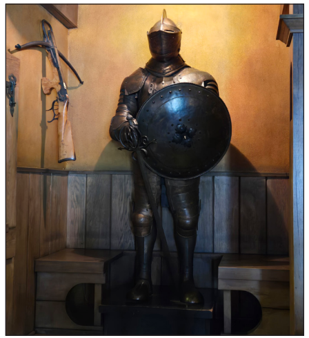
Suit of Armor

We arrived back at the Martin Center at around 5:30 p.m. Our cars were still there. No tickets were issued. We appreciate the cooperation extended to AUAR by the UA Parking Office.