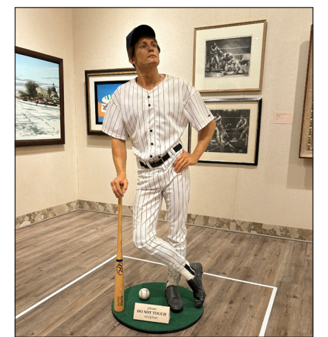
In the Sports Art Gallery

Youngstown was an important industrial contributor to America's war effort during World War II. The work force was largely comprised of immigrants or decedents of people from Eastern European countries directly involved in the war.