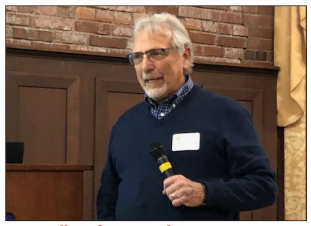
Dan talks about Cuba

the Zapata Peninsula, the largest wetland in the Caribbean. The tour continued further southeast to Trinidad, a UNESCO World Heritage Site, known for its Spanish heritage. The beautifully restored town provided an opportunity for the group to tour the historic sites and the cathedral and to visit the local craft shops.