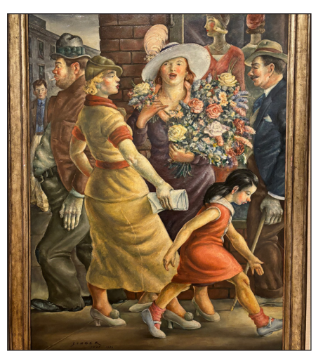
On a crowded street

There are also several Mahoning Valley centered exhibits on the upper levels of the mansion. "Tailor made: Local Clothing and Accessories" includes pieces from the 19th and 20th centuries ranging from simple bonnets to extravagantly beaded evening dresses.